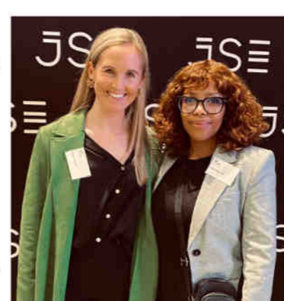
Alexandra Education Committee Cocktail Function